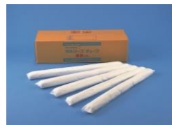
Item code: BF-OL20 Type: Socks Size: 100cm