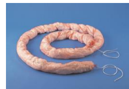
Item code: BF-OL21 Type: Oil fence Size: 150cm, 600cm