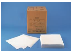
Item code: BF-OL01 Type: Pads Size: 50cm x 50cm