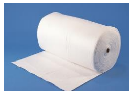
Item code: BF-OL03 Type: Rolls Size: 100cm x 50M 50cm x 50M